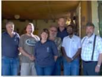
2008 AGM selected committee;