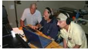
Fieldday 2008 V55V/P