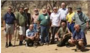
Fieldday 2008 V55V/P