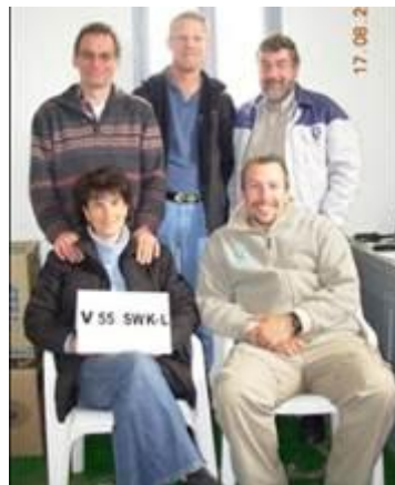
Lighthouse 2008 V55SWK-L