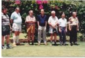
Ham get together in Tsumeb;