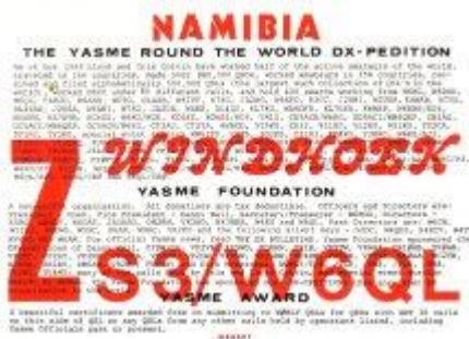
ZS3/W6QL; UNTAG Force in Namibia