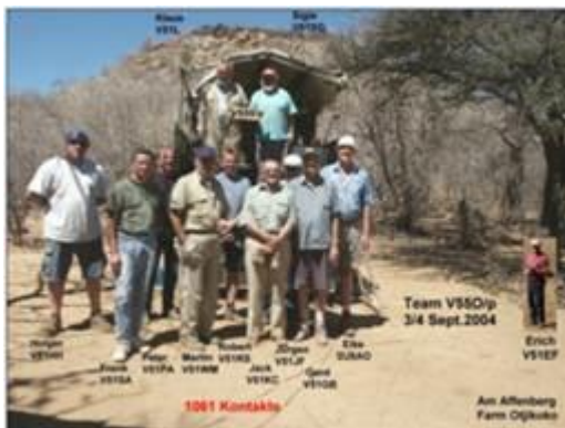
Region1 Fieldday Contest with Call sign V550/p