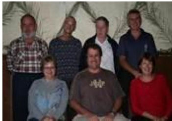
2010 AGM Selected Committee;