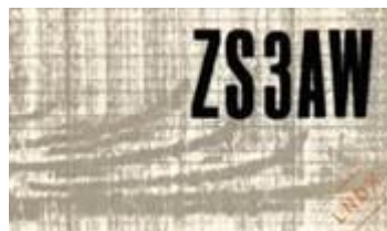
Max Plank Ins. Tsumeb;