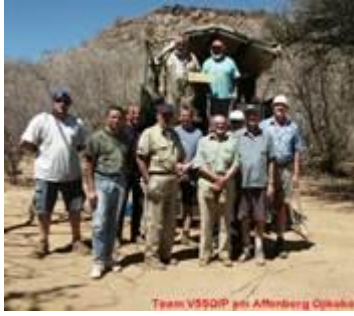
Fieldday 2004 V550/P