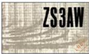
Max Planck Institute / Tsumeb

June 1974 QSL card of Max Planck Institute at Tsumeb