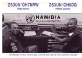
2 members of the