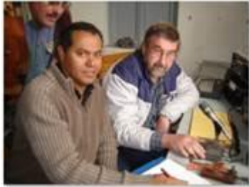
Intern. Lighthouse weekend in Swakopmund;