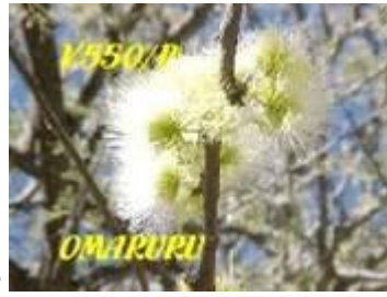
Fieldday 2005 V550/P