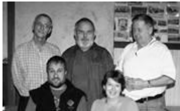
2009 AGM Selected Committee;